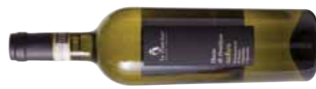
Le Masciare, Anbra, Fiano di Avellino 2012 17.25 (90+) IDA 17 MG 17 EOH 17.5

N/A UK www.cantinecolledisandomenico.it Ripe and aromatic with mature yellow fruit aromas plus notes of honeysuckle and freesia. Round, full and juicy with full, fleshy flavours and a rich, creamy mid-palate. Drink 2014-2017 Alc 13%