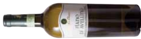
Colle di San Domenico, Fiano di Avellino 2012 17.25 (90+) IDA 17 MG 18 EOH 17

£18.75 Vini Italiani, Grossi Wines Ripe yellow fruit aromas with floral and spicy notes and a hint of smoke. A balanced palate with fair definition of ripe and nutty soft fruit flavours and a stony minerality that builds with aeration. Drink 2015-2018 Alc 13.5%