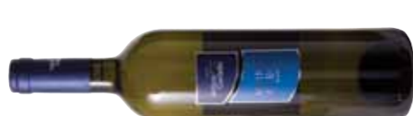
Antico Castello, Greco, Irpinia 2012 17 (90) IDA 16.75 MG 16.5 EOH 17.5

£17.50 (2011) Justerini & Brooks Big, bright and beautiful. Fresh flowers, yellow apple and quince, then orange and lemon curd. Quite attractive ripe fruit flavours with a welcome note of green herbs. Drink 2014-2016 Alc 14%