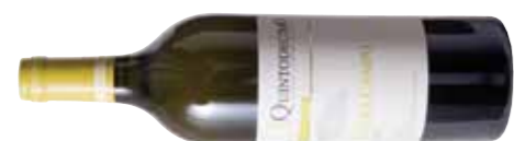
Quintodecimo, Via del Campo, Falanghina, Irpinia 2012 17.25 (90+) IDA 17 MG 17 EOH 17.5

N/A UK www.lemasciare.com Good breadth of aroma with notes of linen, spice and red apple. This is a big, impressive wine that has a full, rich and creamy palate with good ripe fruit flavours and a spicy-toned finish. Drink 2014-2017 Alc 14%