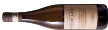
Villa Raiano, Contrada Marotta, Greco di Tufo 2012 17 (90) IDA 16.75 MG 17.5 EOH 16.75

£12 TryWines Ripe citrus notes of grapefruit and mandarin with a floral edge. Smoky, mineral, clean, long and fresh with well-chiselled fruit and a lovely finish. Drink 2014-2018 Alc 13.5%