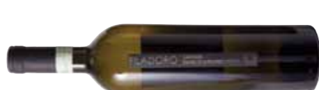
Filadoro, Santàri, Fiano di Avellino 2011 17 (90) IDA 17 MG 16.5 EOH 17.5

N/A UK www.fattorialarivolta.com Full and forward with overripe fruit aromas of melon and preserved lemons. Lovely, balanced, clean and rich with mouthwatering acidity that lifts the peppery, quince flavours nicely. Drink 2014-2017 Alc 12.5%