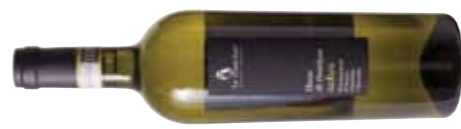
Le Masciare, Anbra, Fiano di Avellino 2012 17.25 (90+) IDA 17 MG 17 EOH 17.5

N/A UK www.cantinedicollisandomenico.it Ripe and aromatic with mature yellow fruit aromas plus notes of honeysuckle and freesia. Round, full and juicy with full, fleshy flavours and a rich, creamy mid-palate. Drink 2014-2017 Alc 13%