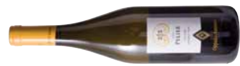
Oppida Aminea, Pelike, Fiano, Sannio 2011 17 (90) IDA 17 MG 17 EOH 17

£16 Lea & Sandeman Light, bright, clean and fresh – simple but well made Fiano. Concentrated and balanced palate of tropical fruit and minerality with a broad floral-toned finish. This has a real sense of place. Drink 2015-2017 Alc 13%