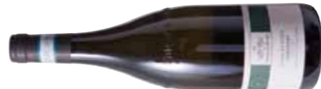
Fattoria La Rivolta, Coda di Volpe, Sannio Taburno 2012 17 (90) IDA 17.5 MG 16.5 EOH 17

£18 Immersus Emergo Full, broad and waxy nose with intense plum and peach aromas. Typical palate of orchard fruit, anise and driven acidity. This is true to its grape variety. Drink 2014-2018 Alc 13%