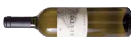
Luigi Maffini, Kràtos, Paestum 2012 17 (90) IDA 16.75 MG 17.5 EOH 17

N/A UK www.filadoro.it Mature and ripe with subtle citrus notes. A full palate of luscious soft fruit flavours and a balanced, smoky, clean finish. Looking good now and can age. Drink 2014-2019 Alc 13.5%