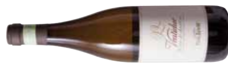
Villa Raiano, Ventidue, Fiano di Avellino 2011 17 (90) IDA 17 MG 17.5 EOH 16.5

£19.50 Prestige Food & Wine Very floral – almost Fiano-like – nose of orange blossom. Ripe, round and full with developed flavours of ginger. Lively acidity cleanses the palate of its chewy tannins and extract. Drink 2014-2017 Alc 13.5%