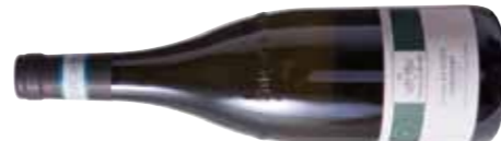
Fattoria La Rivolta, Coda di Volpe, Sannio Taburno 2012 17 (90) IDA 17.5 MG 16.5 EOH 17

£18 Immersus Emergo Full, broad and waxy nose with intense plum and peach aromas. Typical palate of orchard fruit, anise and driven acidity. This is true to its grape variety. Drink 2014-2018 Alc 13%