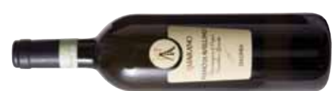
Amarano, Dulcinea, Fiano di Avellino 2011 17.25 (90+) IDA 17 MG 17 EOH 17.5

£18.75 Vini Italiani, Grossi Wines Ripe yellow fruit aromas with floral and spicy notes and a hint of smoke. A balanced palate with fair definition of ripe and nutty soft fruit flavours and a stony minerality that builds with aeration. Drink 2015-2018 Alc 13.5%